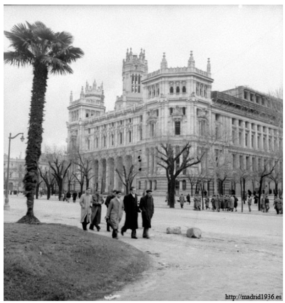
The Madrid Central Post Office in 1936. (http://madrid1936.es/madrid/imagesdeschamps/000003fl.jpg [Accessed 5 July 2020])

A postcard with a view of the post office.