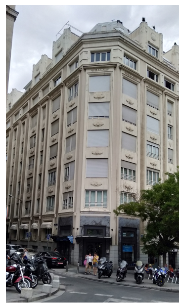
Marianne's first, temporary apartment. Plaza de las Cortes 3, Madrid. June 2019.