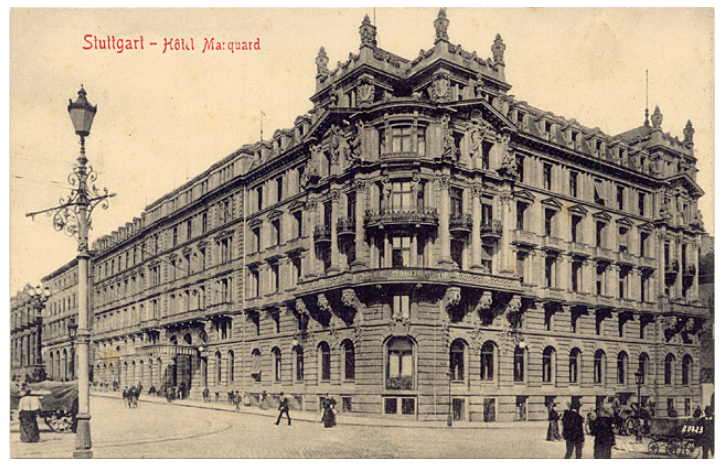
The Hotel Marquard on the Stuttgart Schlossplatz around 1905. Undated postcard.

would be nice if we were together - than to be together and sad, dissatisfied, ground down by the eternal monotony of everyday life, since for me everyday life had become monotonous and would have remained so. Think about me a lot – I'm eager for the future. And, ultimately, I have you to thank for everything because you let me study until I became what I am now. It would have been nice if my home country had given me what a foreign land is now giving me without being asked! But one never gets everything in life and for the first time in years I have the feeling that things might turn out well for me. I will write to you often and about everything so we really will be together ---