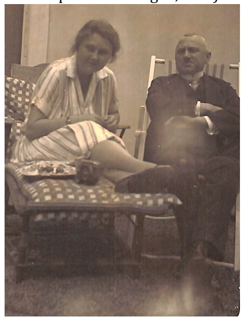
As a Freiburg PhD student visiting her parents in Langenberg. Summer, 1926.

French occupation forces leave Langenberg in 1924.